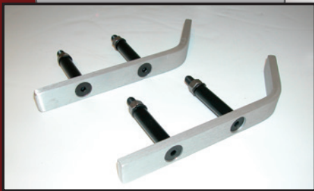
Model #4112 Footend Rails