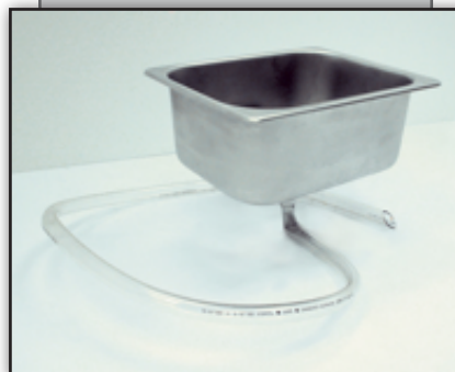
Model #4137 Urology Pan