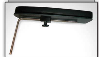
Model #4124 Arm Board

Requires #4111 Headend Rails and #6109 or #6110 clamp