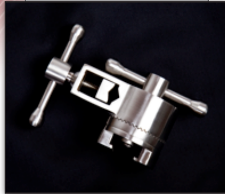
Model #6110 Tri-Clamp