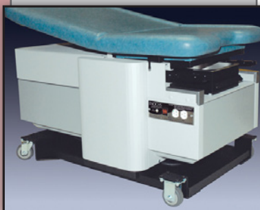
Model #4150 Caster Base